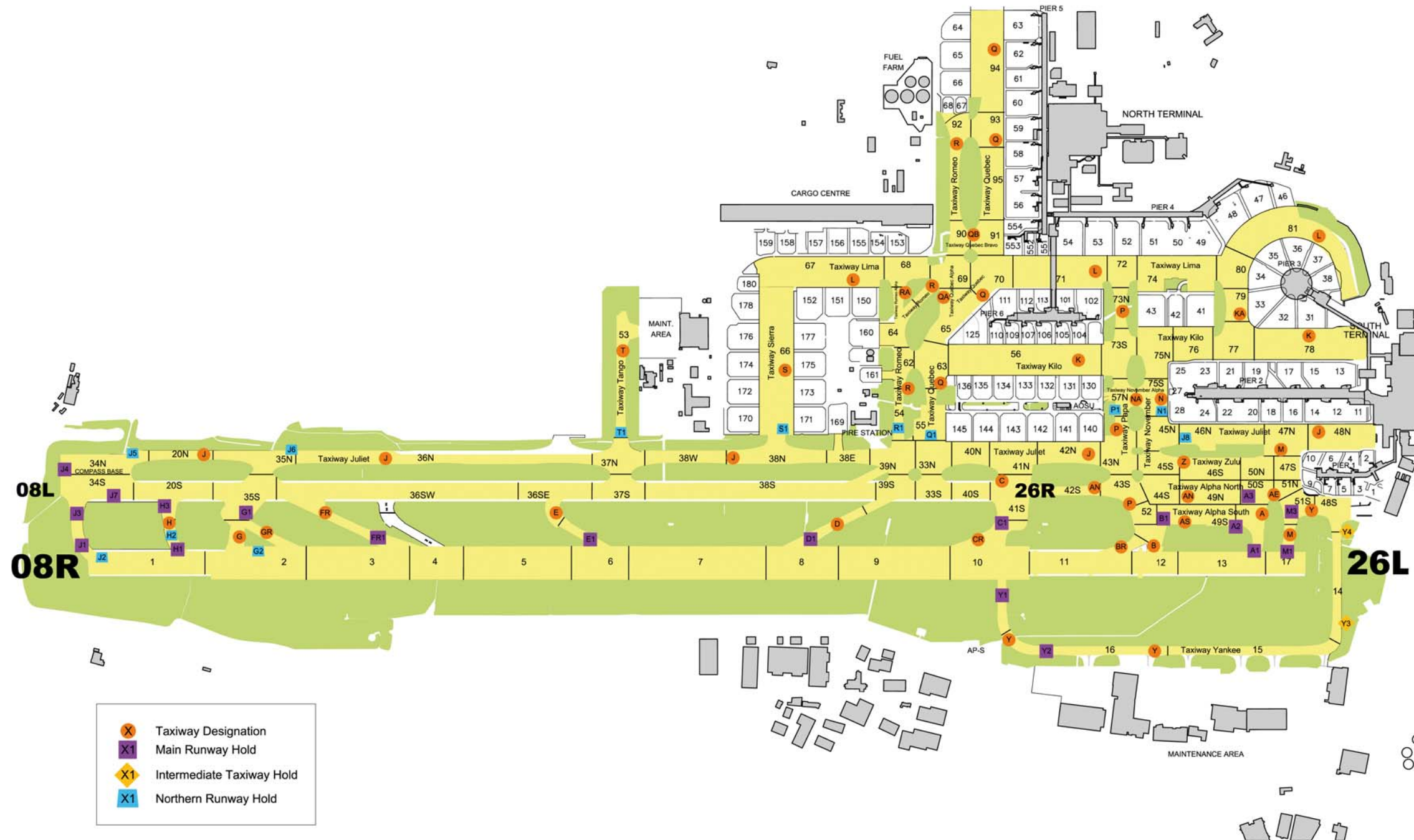
FIGURE 3 Gatwick Airport 2007